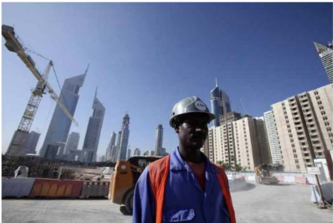
A labourer poses in front of a construction area in Dubai.

Today the average size of villas is smaller in comparison to the previous market offer.