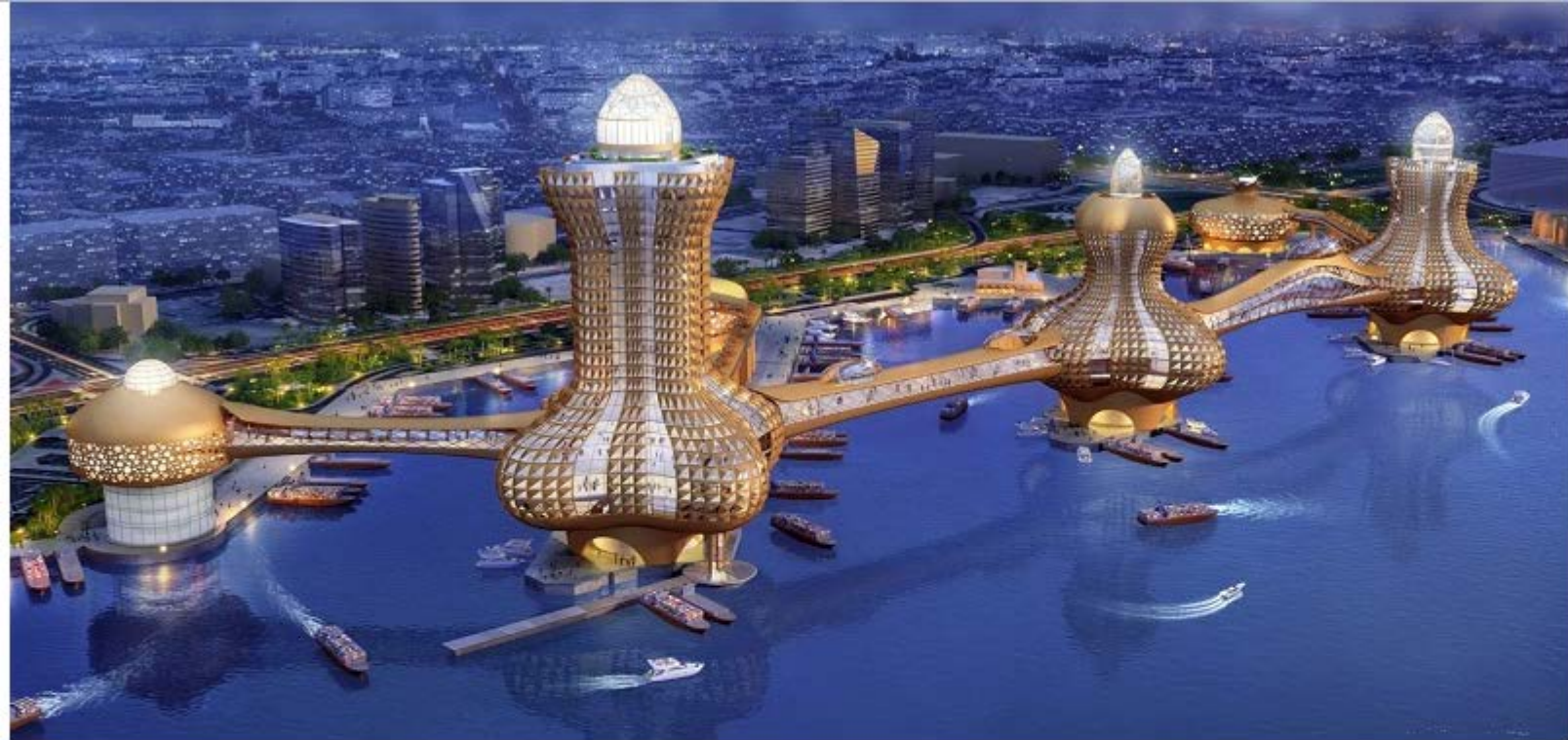
City of Aladdin – Dubai Creek. Estimated completion date: Q2 2020