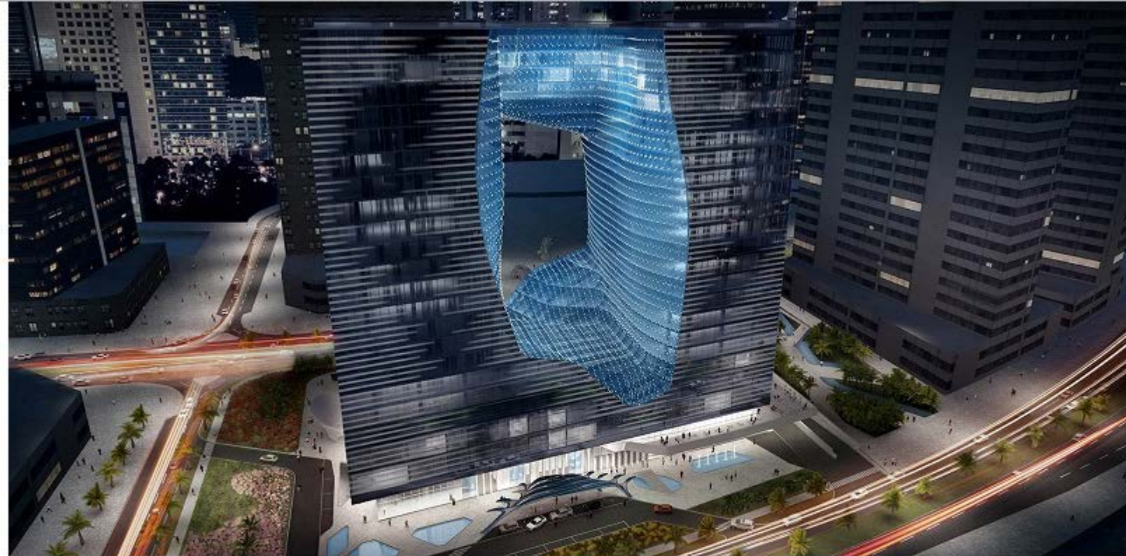
The Opus – Business Bay. Estimated Completion Date: Q4 2018