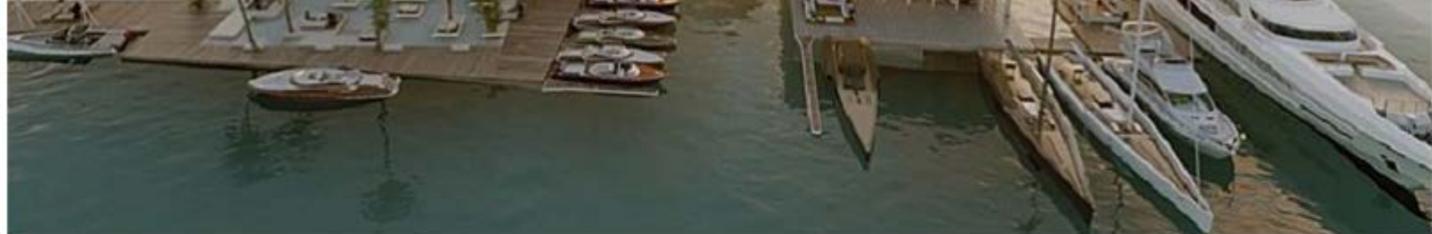
The Floating Venice – The World Islands. Estimated completion date: Q4 2020

The event will also feature a rich education agenda with high-level summits and practical workshops. Under the theme “Shaping the future of construction”, the 39th edition of The Big 5 will introduce the brand new Live Innovation Zone, where demonstrations will feature some of the newest and most innovative products available, and the Start-up City, gathering the next construction tech disruptors.