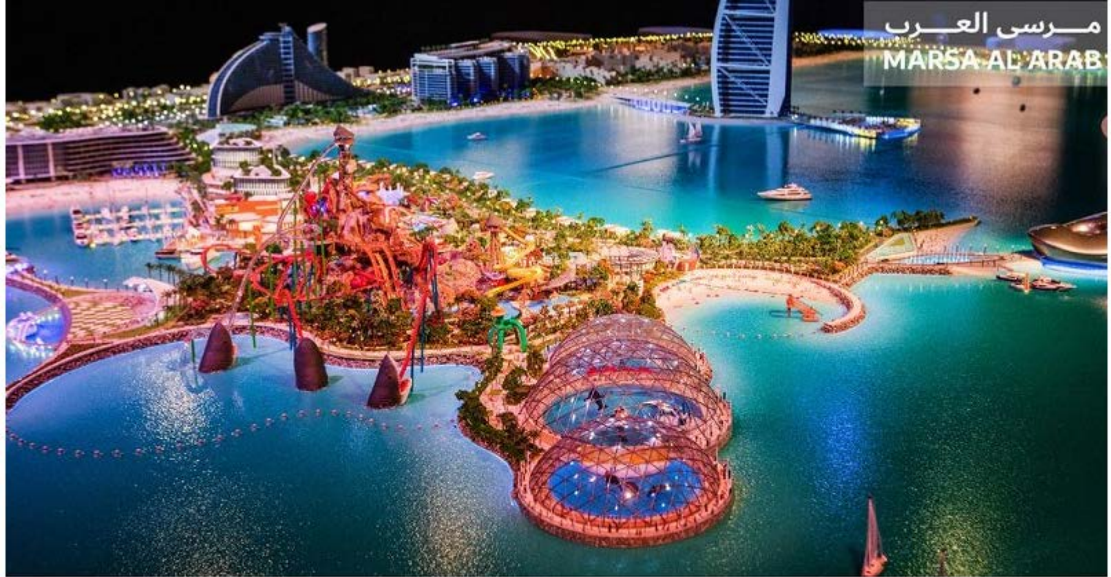
Marsa Al Arab Island 2 – Madinat Jumeirah. Estimated completion date: Q3 2020

The Emirate's hotel inventory is growing quickly. Seventeen hospitality projects worth over USD 860 million were delivered in the first quarter of 2018 only.