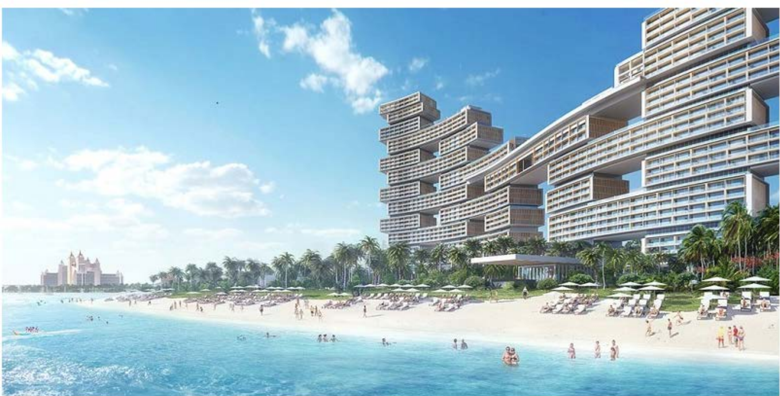
Royal Atlantis Resort and Residences – Palm Jumeirah. Estimated completion Date: Q3 2019

A report produced by BNC Network for The Big 5, the largest event for the construction industry in the Middle East, reveals a 6.1% year on year increase in the value of Dubai's hospitality projects in Q1 2018. Comprising new hotels, resorts and hotel apartments, these are worth a total of over USD 43 Billion.